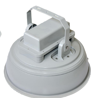
Light and Compact