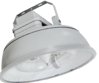
All-New U.S.A. Design