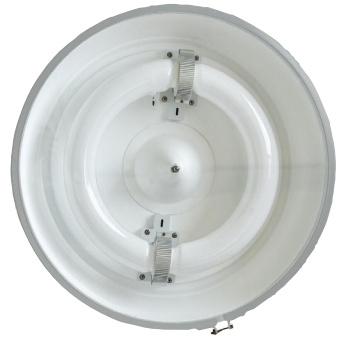
Up to 20% more light coverage