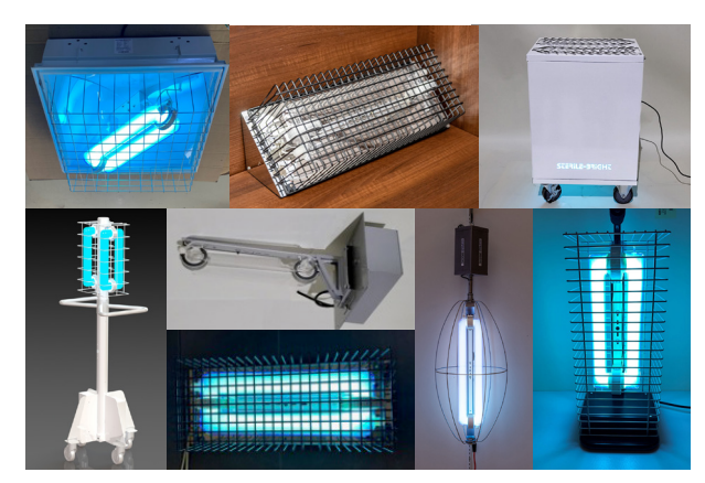
Check out the full line of Sterile-Bright® products.